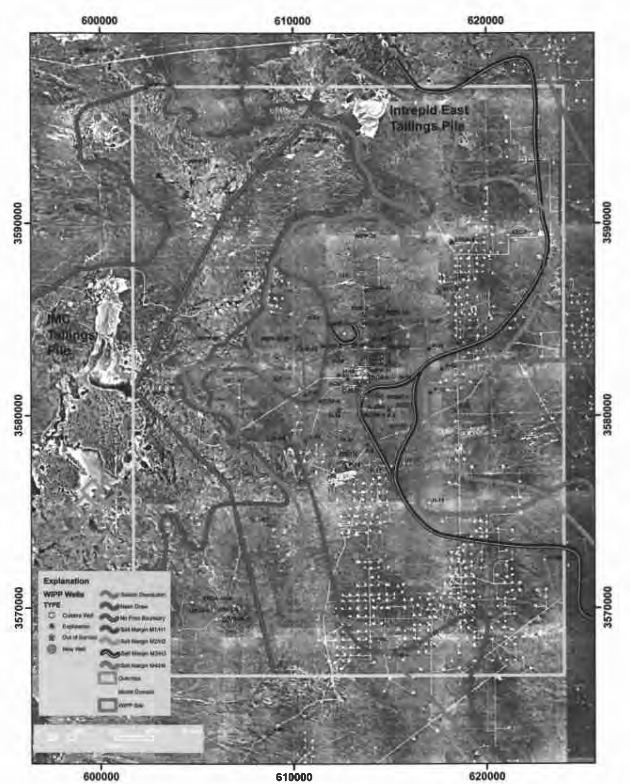
Figure 3. Air-photo map of WIPP area showing halite and dissolution margins and tailings piles.